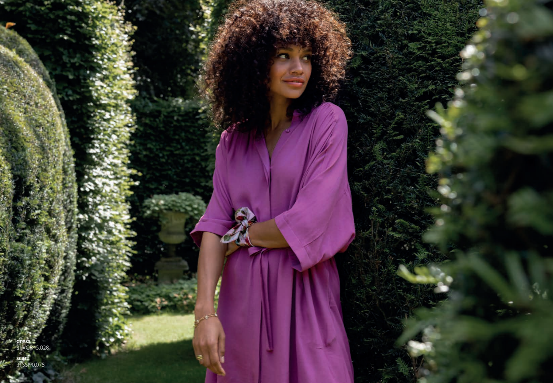
dress 31VCR45.028 scarf 31SSI90.075