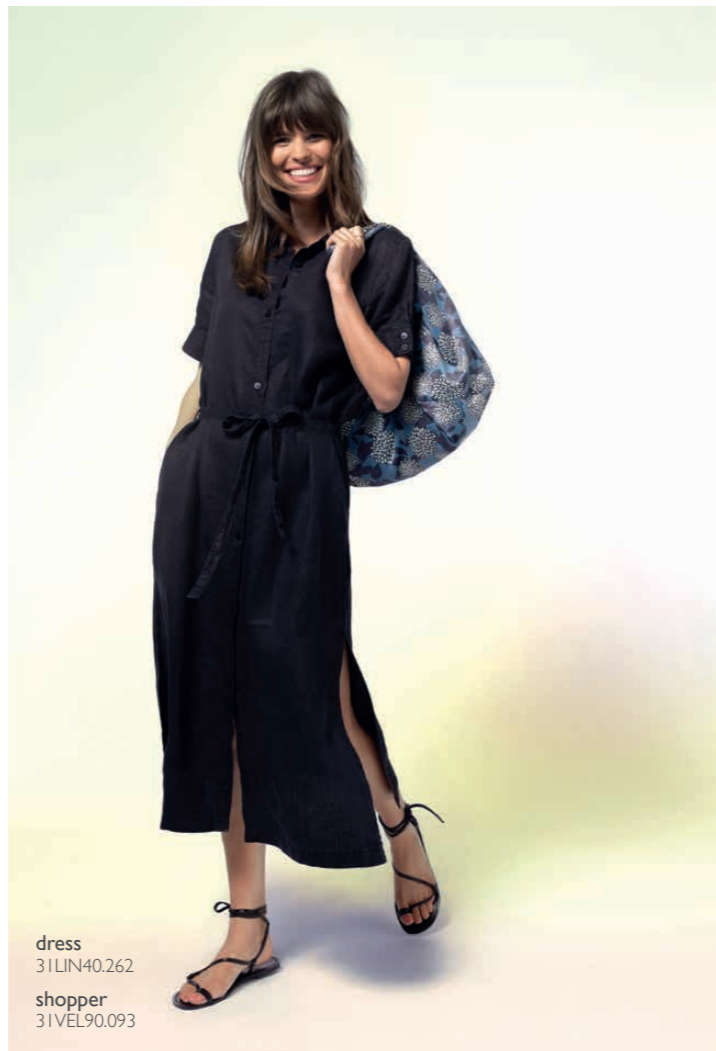
dress 31LIN40.262 shopper 31VEL90.093