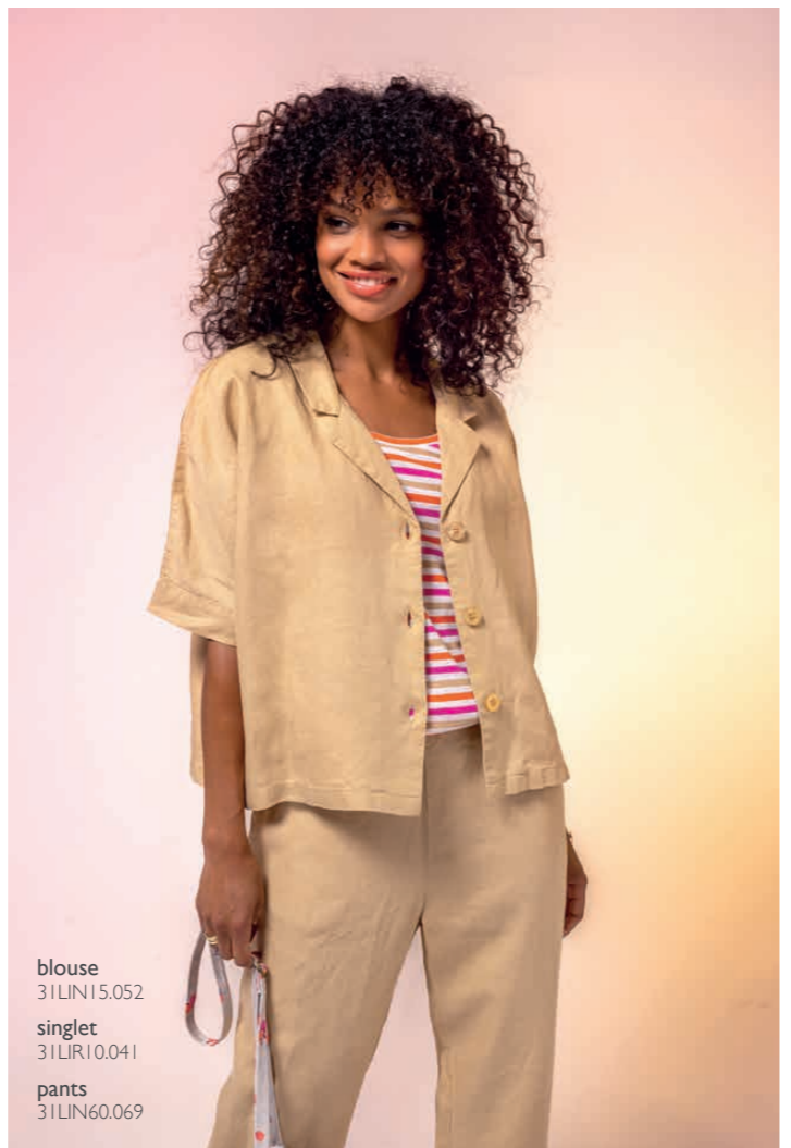
blouse 31LIN15.052 singlet 31LIR10.041 pants 31LIN60.069