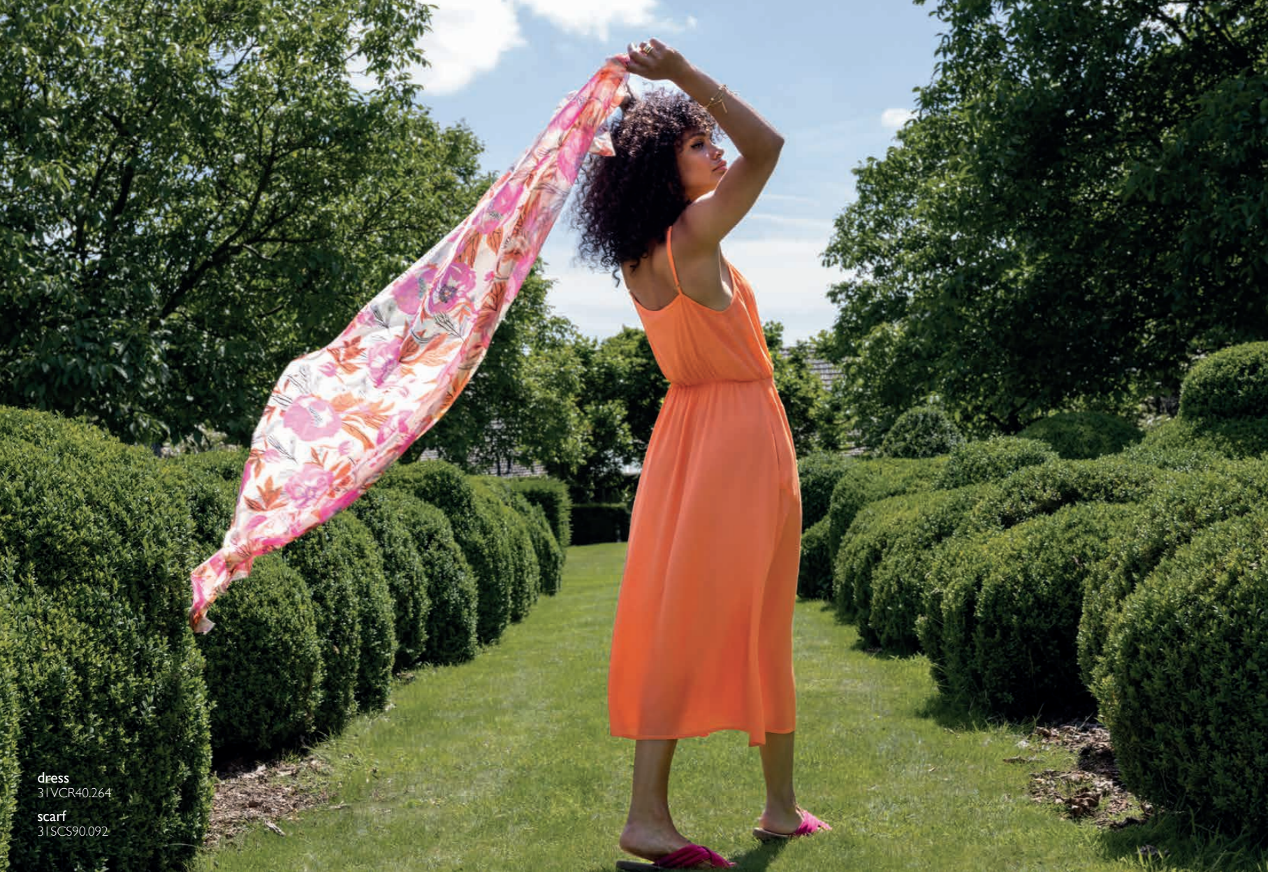
dress 31VCR40.264 scarf 31SCS90.092