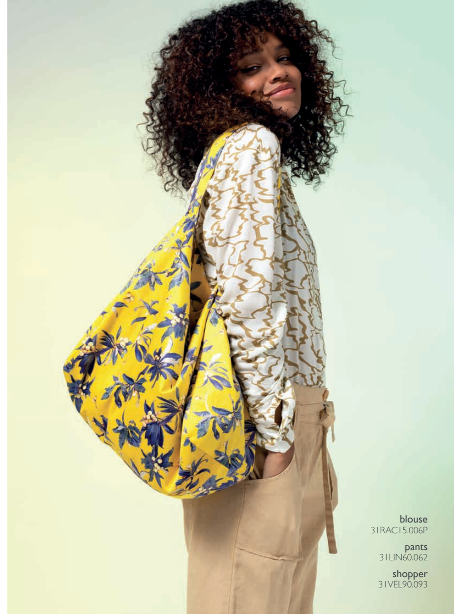
blouse 31RAC15.006P pants 31LIN60.062 shopper 31VEL90.093