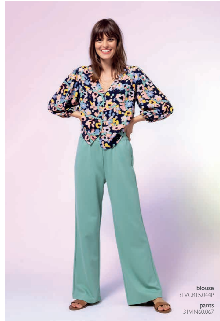
blouse 31VCR15.044P pants 31VIN60.067