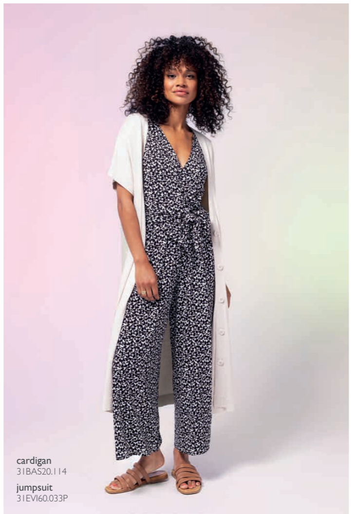
cardigan 31BAS20.114 jumpsuit 31EV160.033P