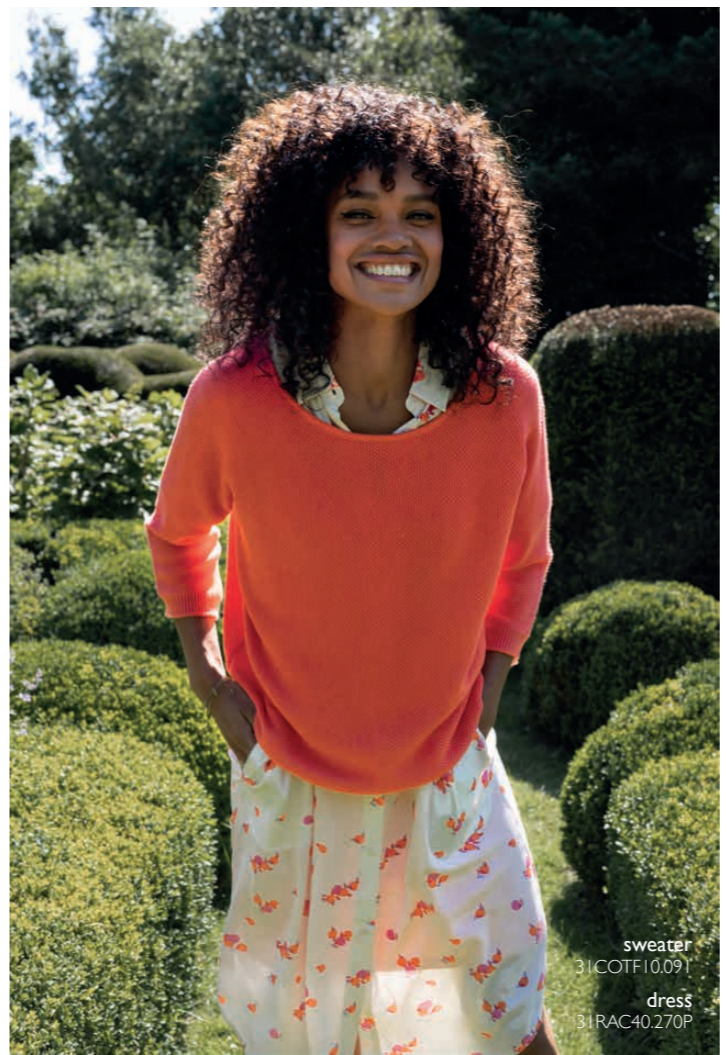
sweater 31COTF10.091 dress 31RAC40.270P