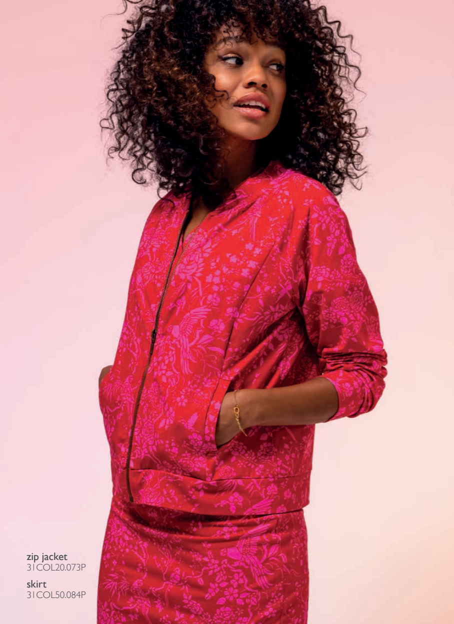
zip jacket 31COL20.073P skirt 31COL50.084P