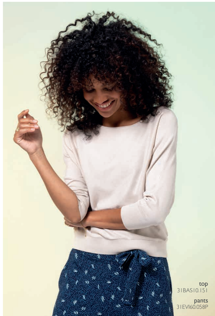
top 31BAS10.151 pants 31EVI60.058P