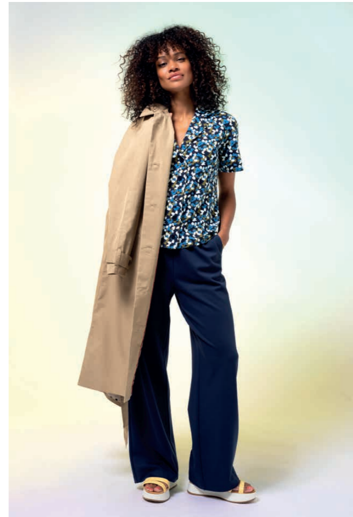
coat 99COW80.023 blouse 31COL15.046P pants 31VIN60.067