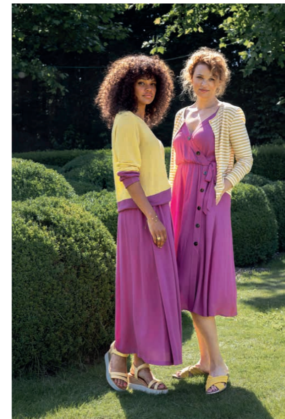
top 31COM30.074 skirt 31VCR50.082