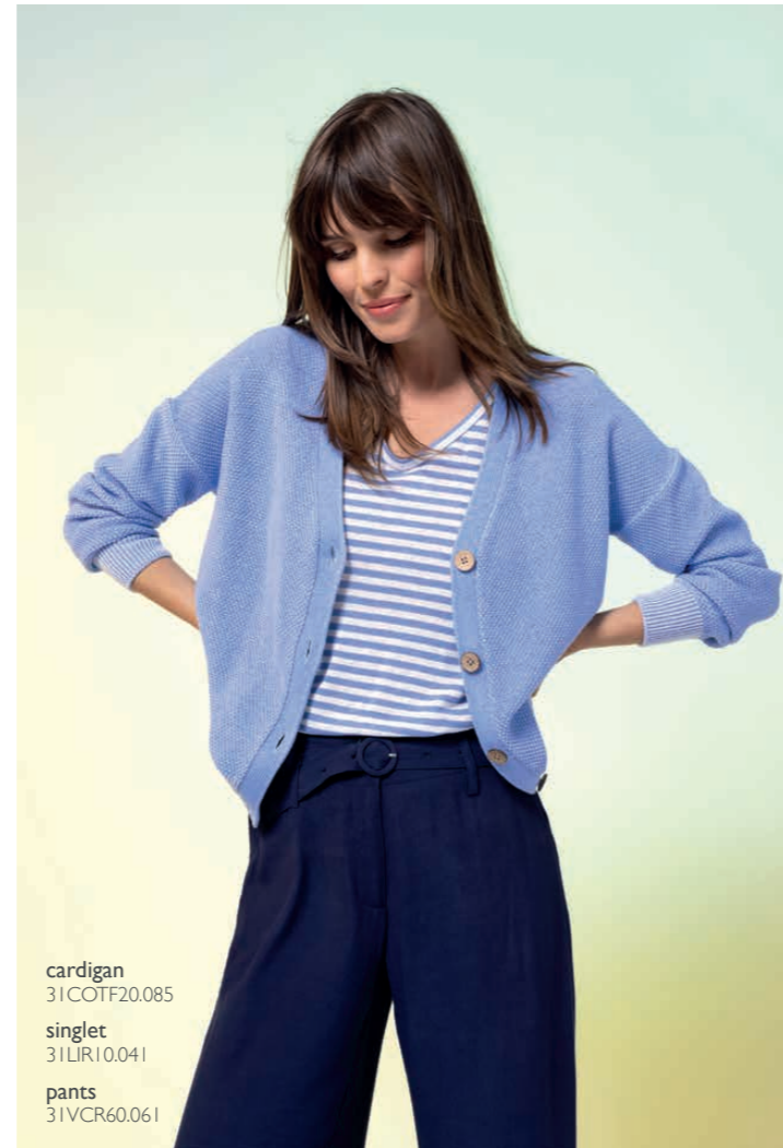
cardigan 31COTF20.085 singlet 31LIR10.041 pants 31VCR60.061