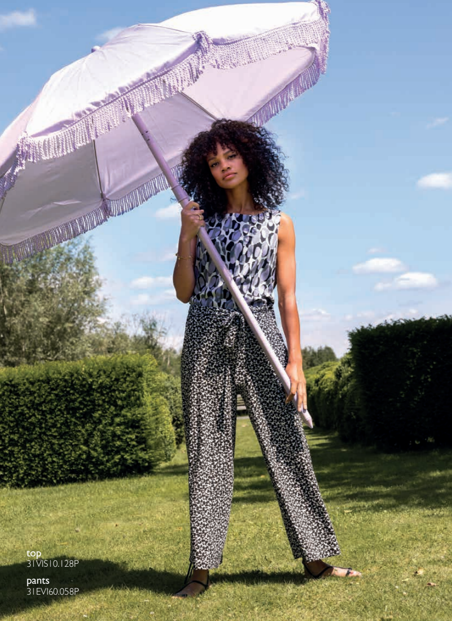
top 31VIS10.128P pants 31EV160.058P