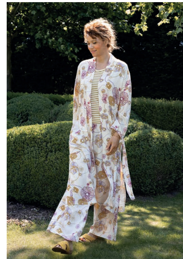
kimono 31EWW20.107P singlet 31LIR10.041 pants 31EWW60.051P