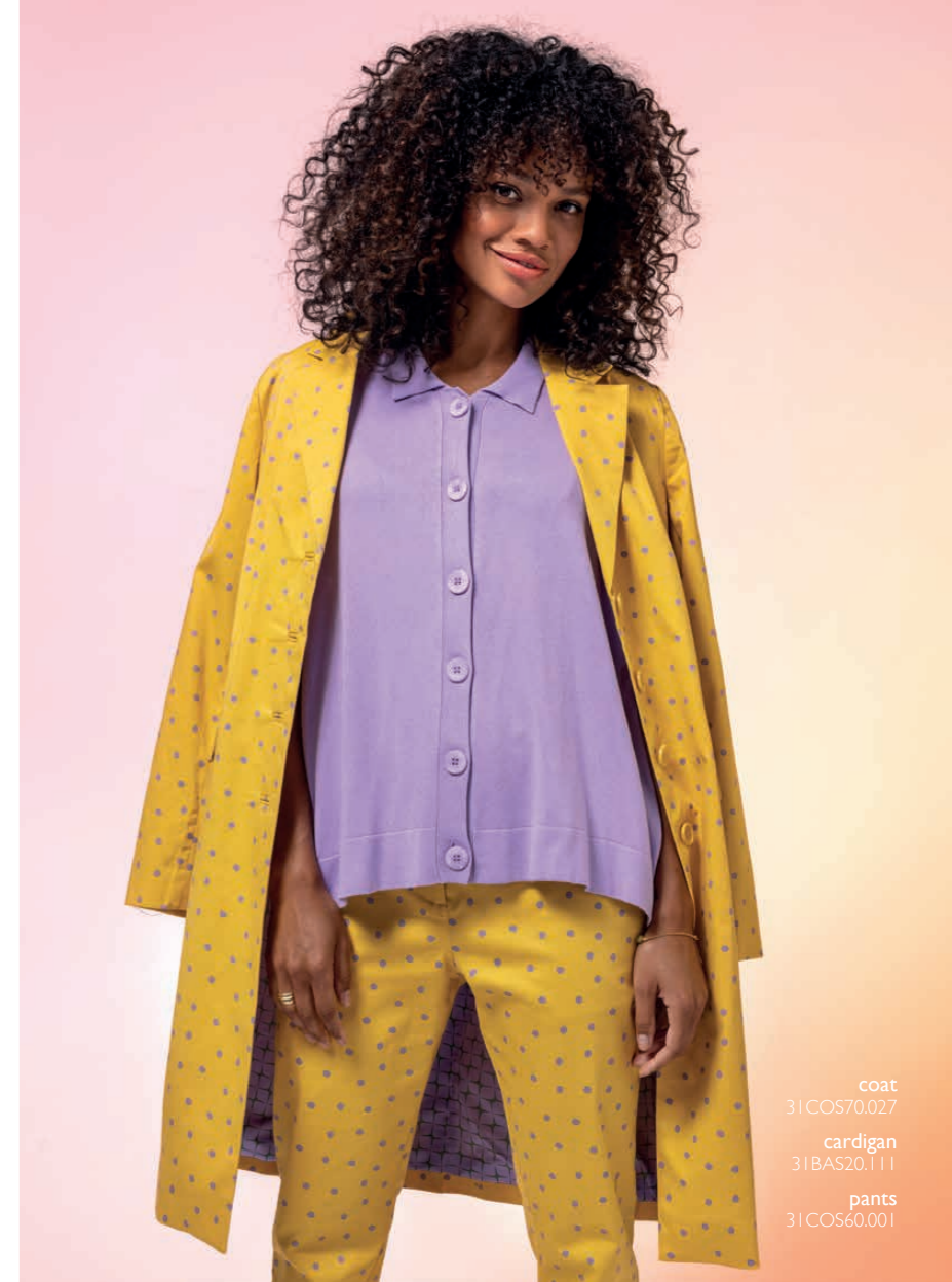
coat 31COS70.027 cardigan 31BAS20.111 pants 31COS60.001