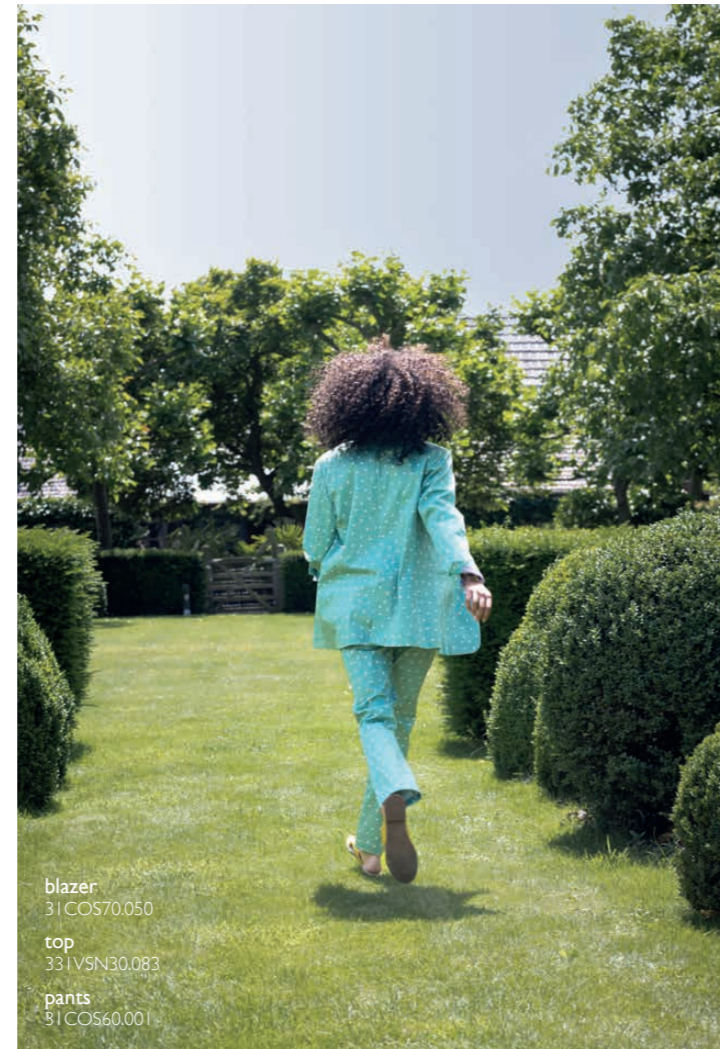
blazer 31COS70.050 top 331VSN30.083 pants 31COS60.001