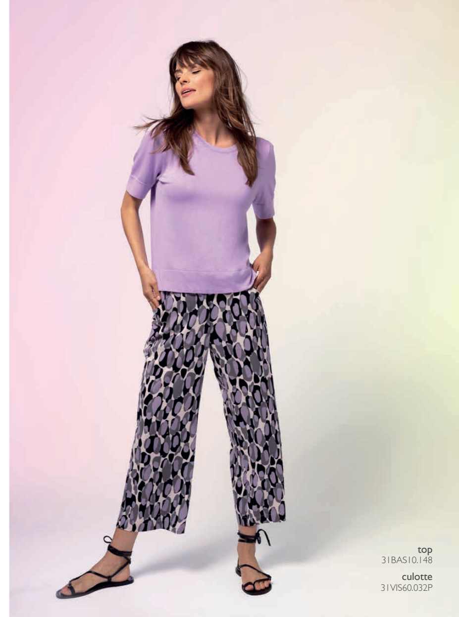
top 31BAS10.148 culotte 31VIS60.032P