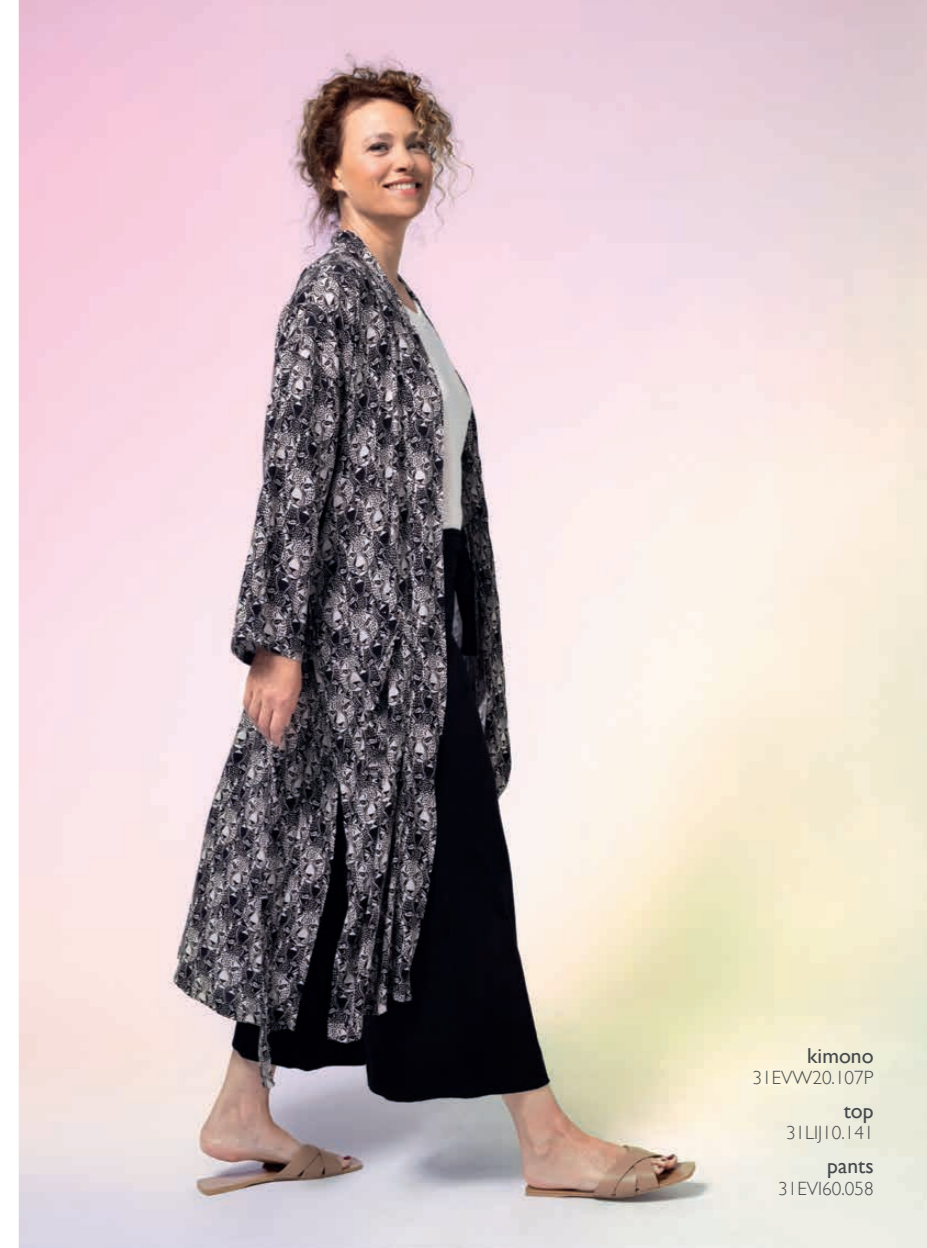
kimono 31EWW20.107P top 31LJJ10.141 pants 31EVI60.058