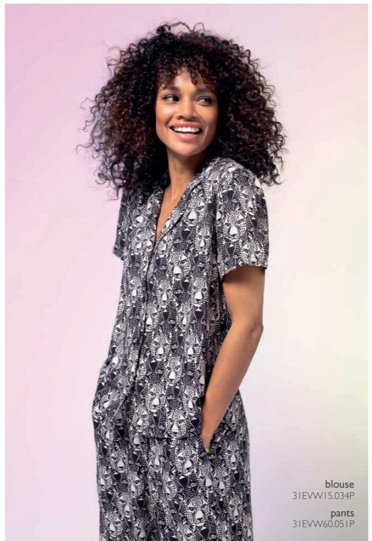
blouse 31EWW15.034P pants 31EWW60.051P