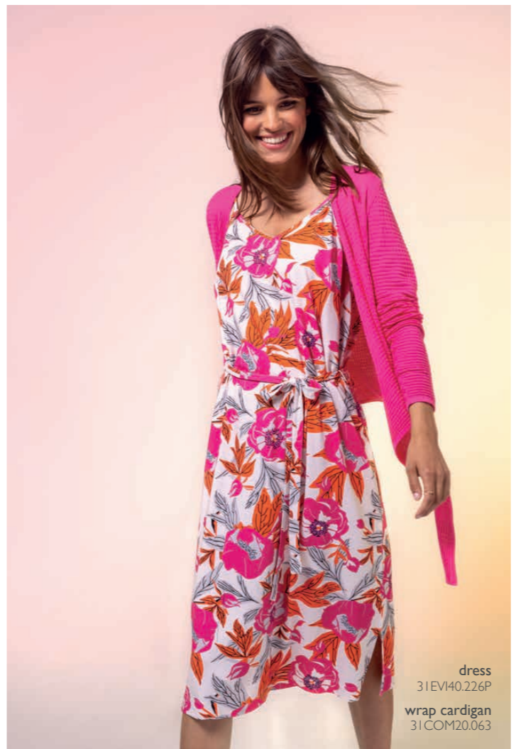
dress 31EVI40.226P wrap cardigan 31COM20.063