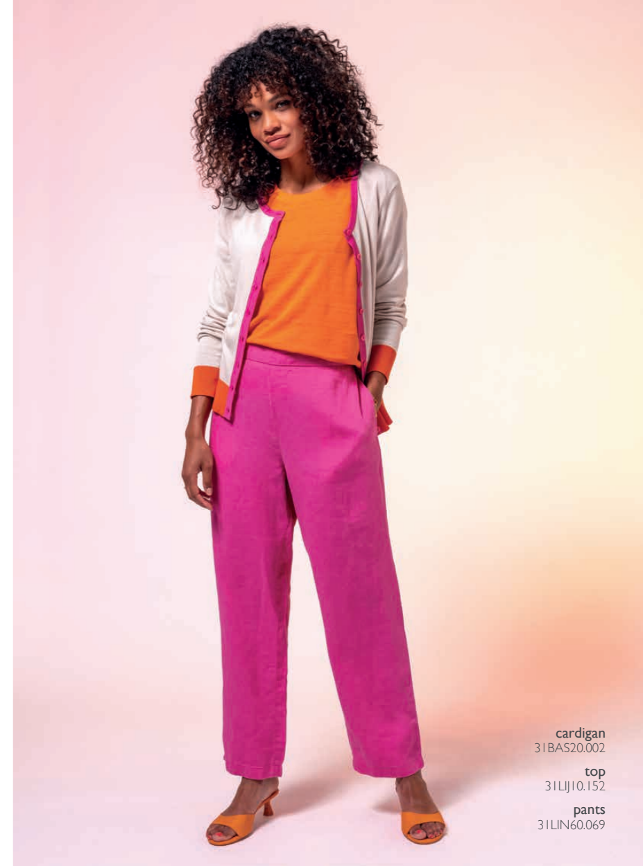
cardigan 31BAS20.002 top 31LJJ10.152 pants 31LIN60.069