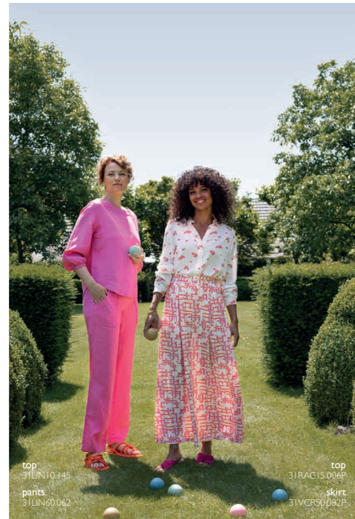
top 31LIN10.145 pants 31LIN60.062